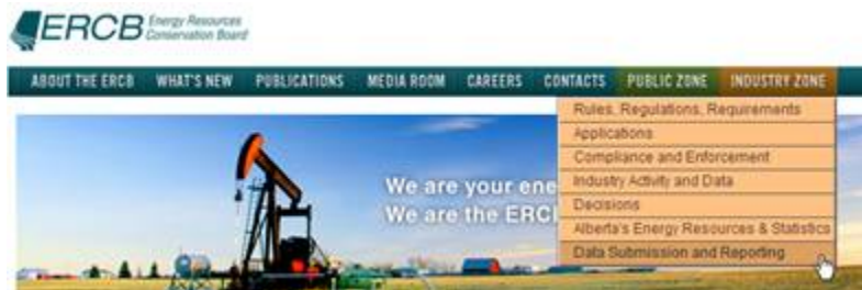
Figure 1: Industry Zone menu

To log onto the EPAP System, navigate to the ERCB public Web site ( www.ercb.ca ). Click on the “Industry Zone” tab in the horizontal menu, to initiate the drop-down menu. Then select “Data Submission and Reporting” and click.