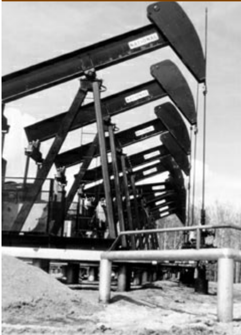
The modern-day challenges of conservation are highlighted by the Board's recent decision to shut in 146 gas wells in northern Alberta to conserve valuable bitumen resources. See story on page 3.