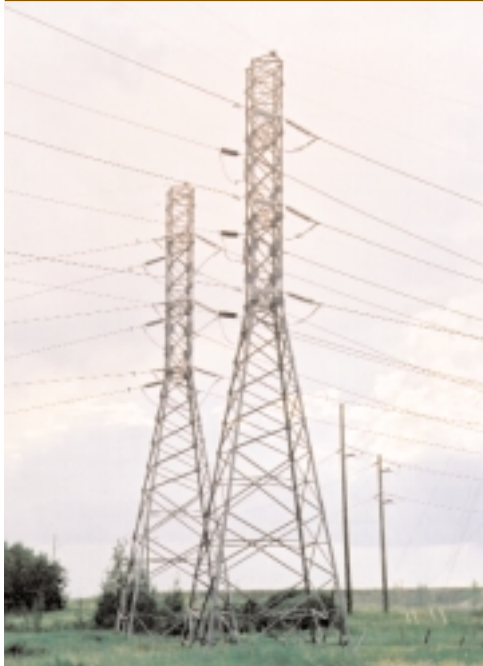
Electrical deregulation will soon give customers a choice in who their electric power retailer will be. (See story, page 3)