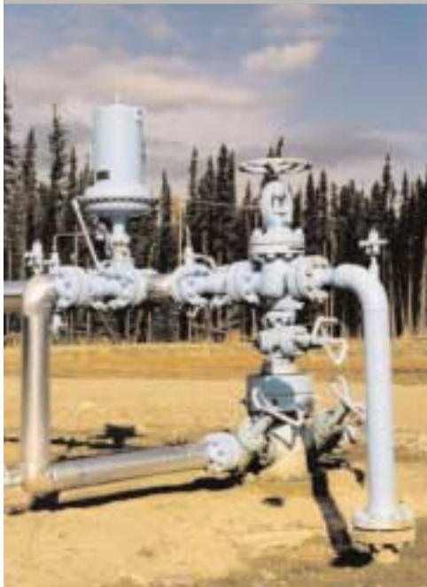
Recommendations for changes to sour gas development are outlined in the recently released Public Safety and Sour Gas Findings and Recommendations Report (see story, right).