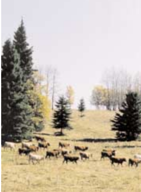
The EUB details proposed implementation plans for initiating actions on 50 recommendations related to public safety and sour gas. (See story, right.)